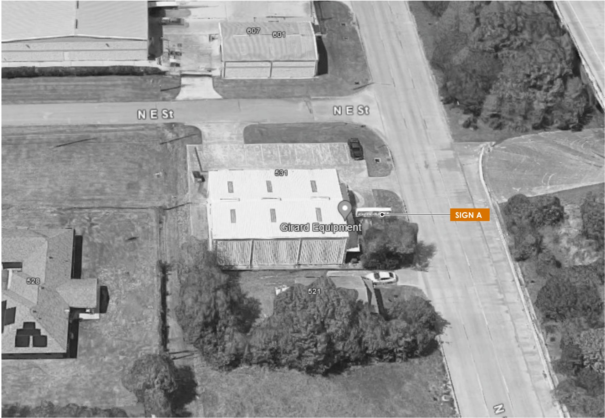
SIGN LOCATIONS SCALE: NTS