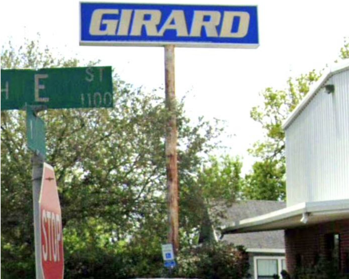
EXISTING ELEVATION SCALE: 1/8" = 1'-0"