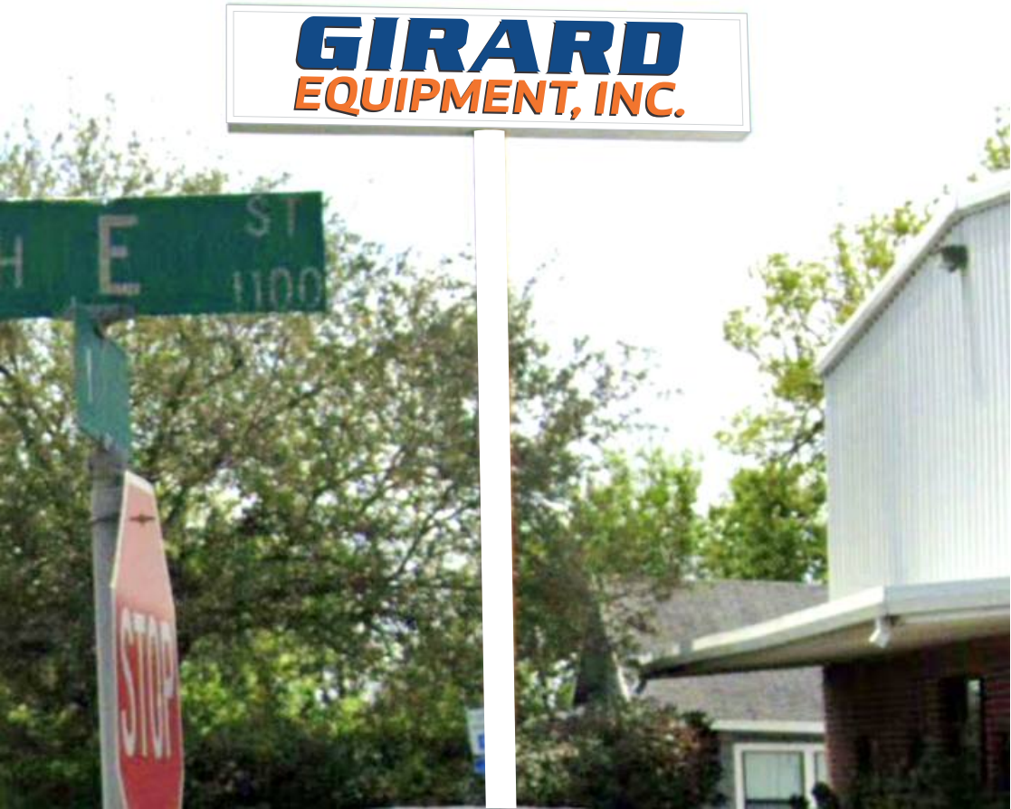
UPDATED ELEVATION SCALE: 1/8" = 1'-0"