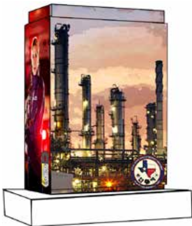
"La Porte Public Safety" Dedicated to La Porte's Public safety workers.