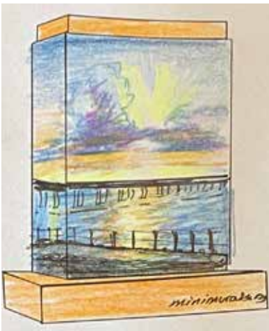
Sunrise LaPorte Celebrating the coast at sunrise