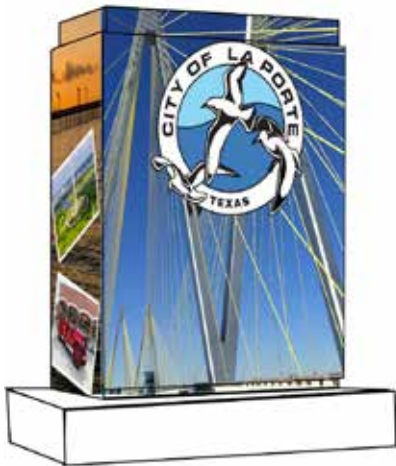
"La Porte Points" shows several of La Porte's points of interest.